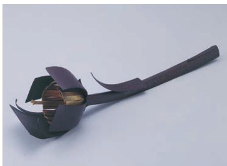
《置物 花の折枝》1927年 個人蔵