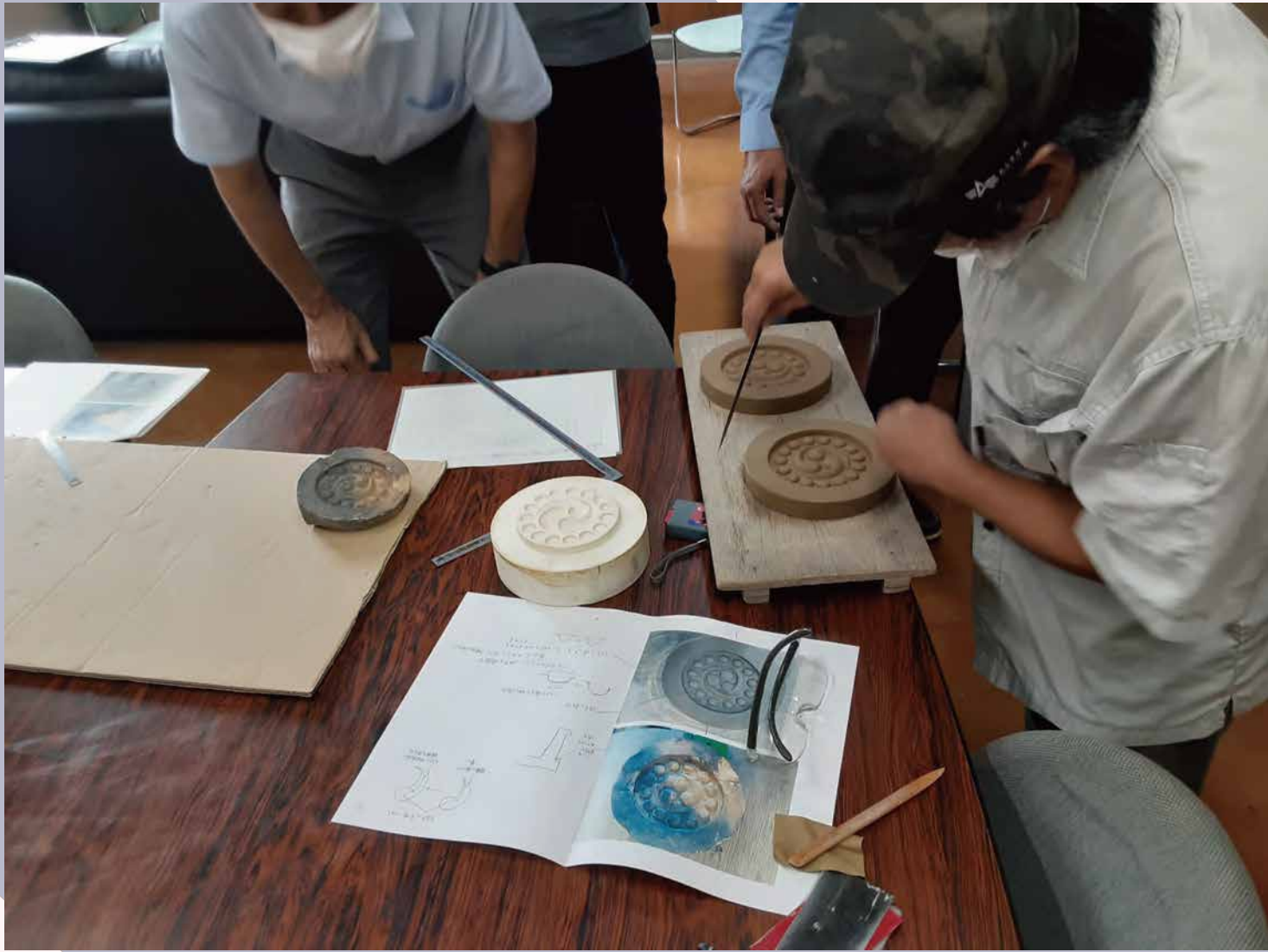
Making Roof Tiles

Many craftsmen, including carpenters, tilers, plasterers, and stonemasons, were involved in the construction exercising their knowledge and skills. While using modern tools, such as heavy machinery and power tools, careful handiwork was done with a strong awareness of Edo Period (1603-1867) and the texture (landscape) of the structure. Look for the modern craftsmanship, which can be seen here and there. It has made it possible to restore this historic gate.