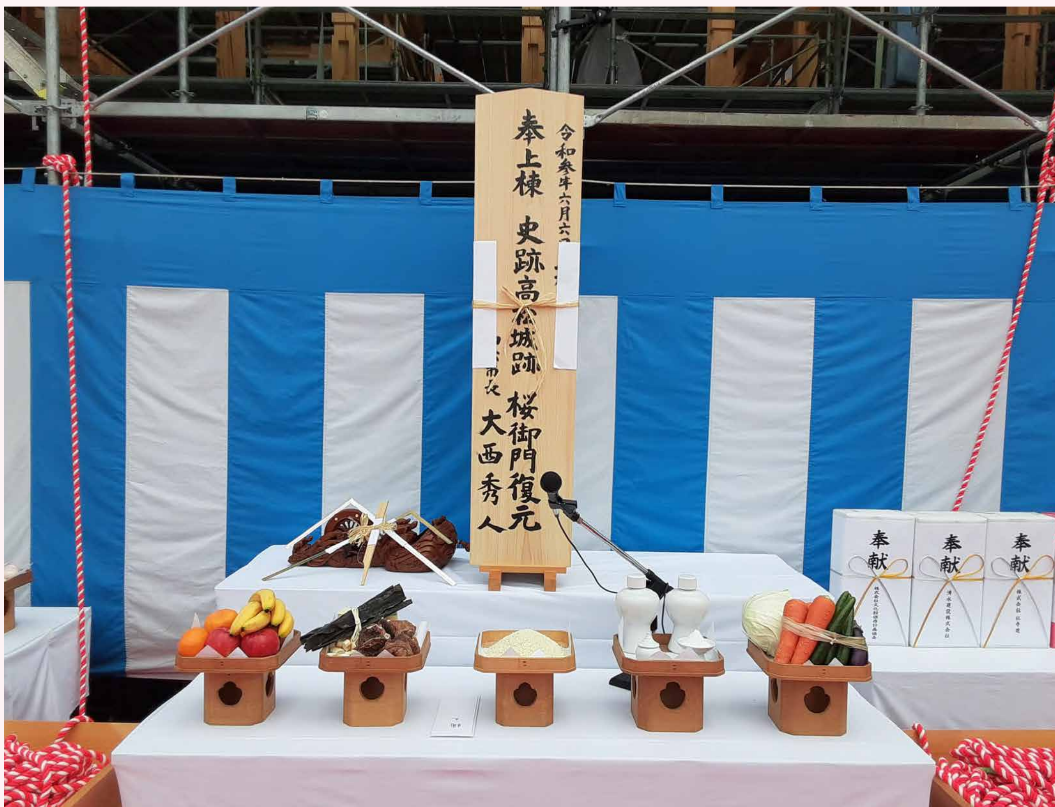
Building Tag for Sakura Gomon