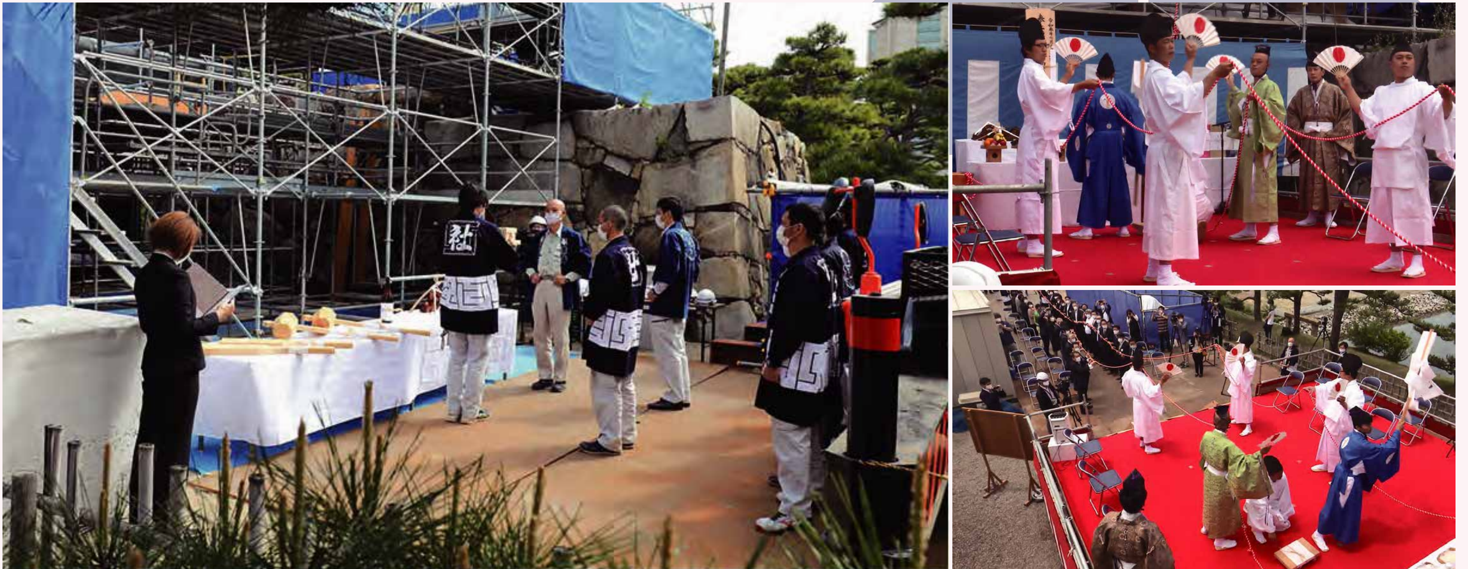
Pillar Raising Ceremony

By the contractor, Ritchu-shiki , a pillar raising ceremony, was held before the pillars were erected, and Joto-shiki , a ridgepole raising ceremony, was performed when the ridgepole was attached to the pillars and beams. On the occasion of the ridgepole raising, a building tag was made, and everyone involved in the construction celebrated as well as prayed for the safe completion of the construction. The carpenters involved in the construction played a central role in the ritual.