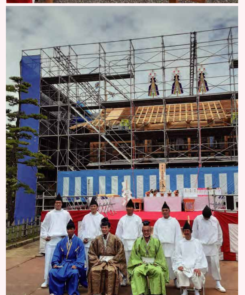
Ridgepole Raising Ceremony