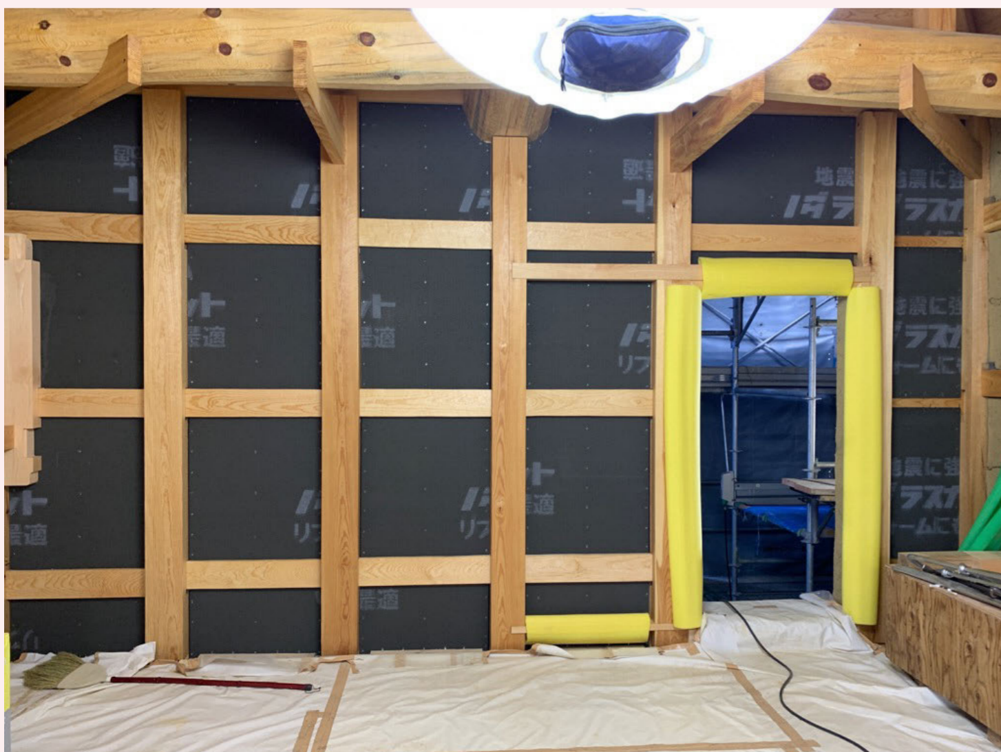
Structural Plywood Installed in the Wall