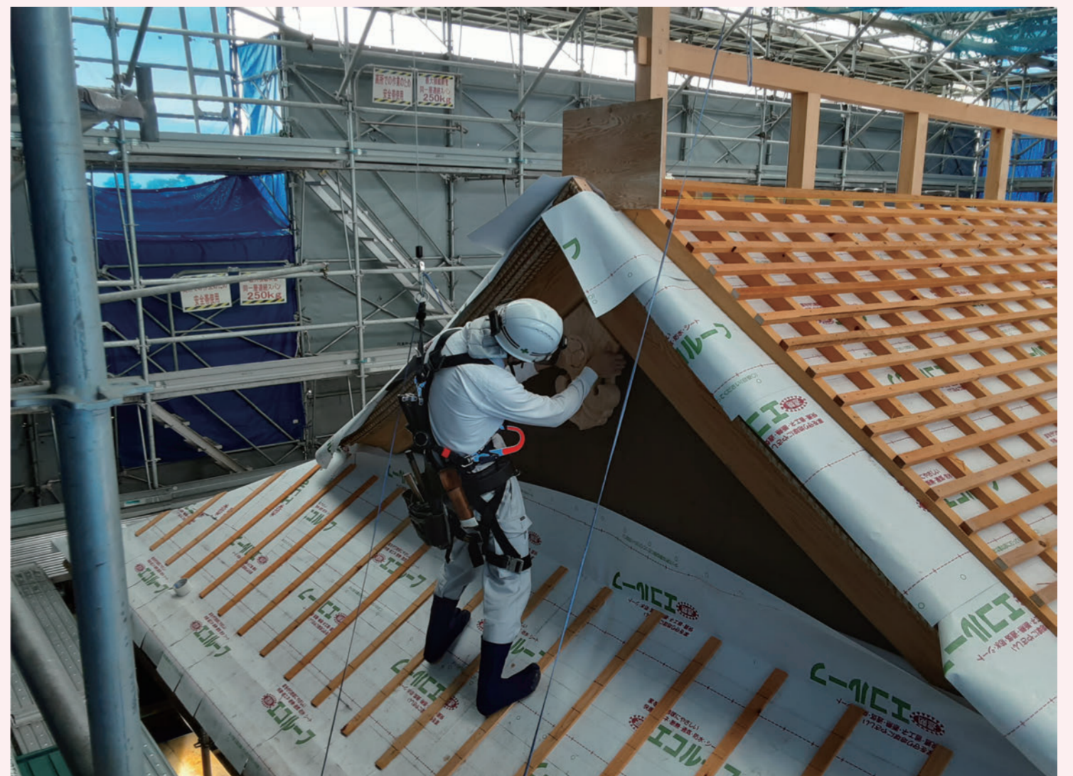
Insulation / Ventilation / Waterproof Sheets Installed under Roof Tiles