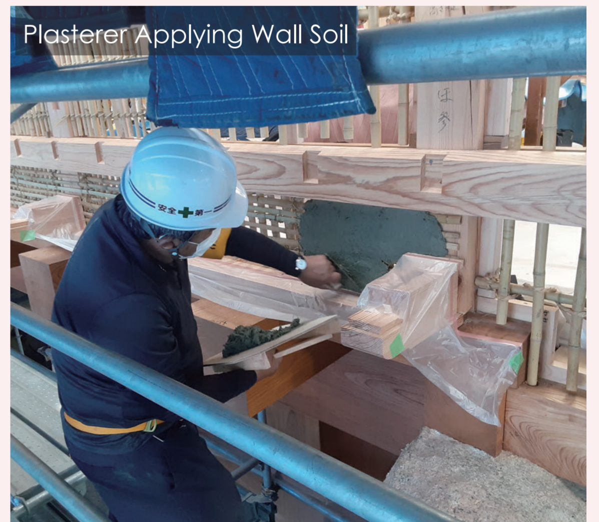
Plasterer Applying Wall Soil