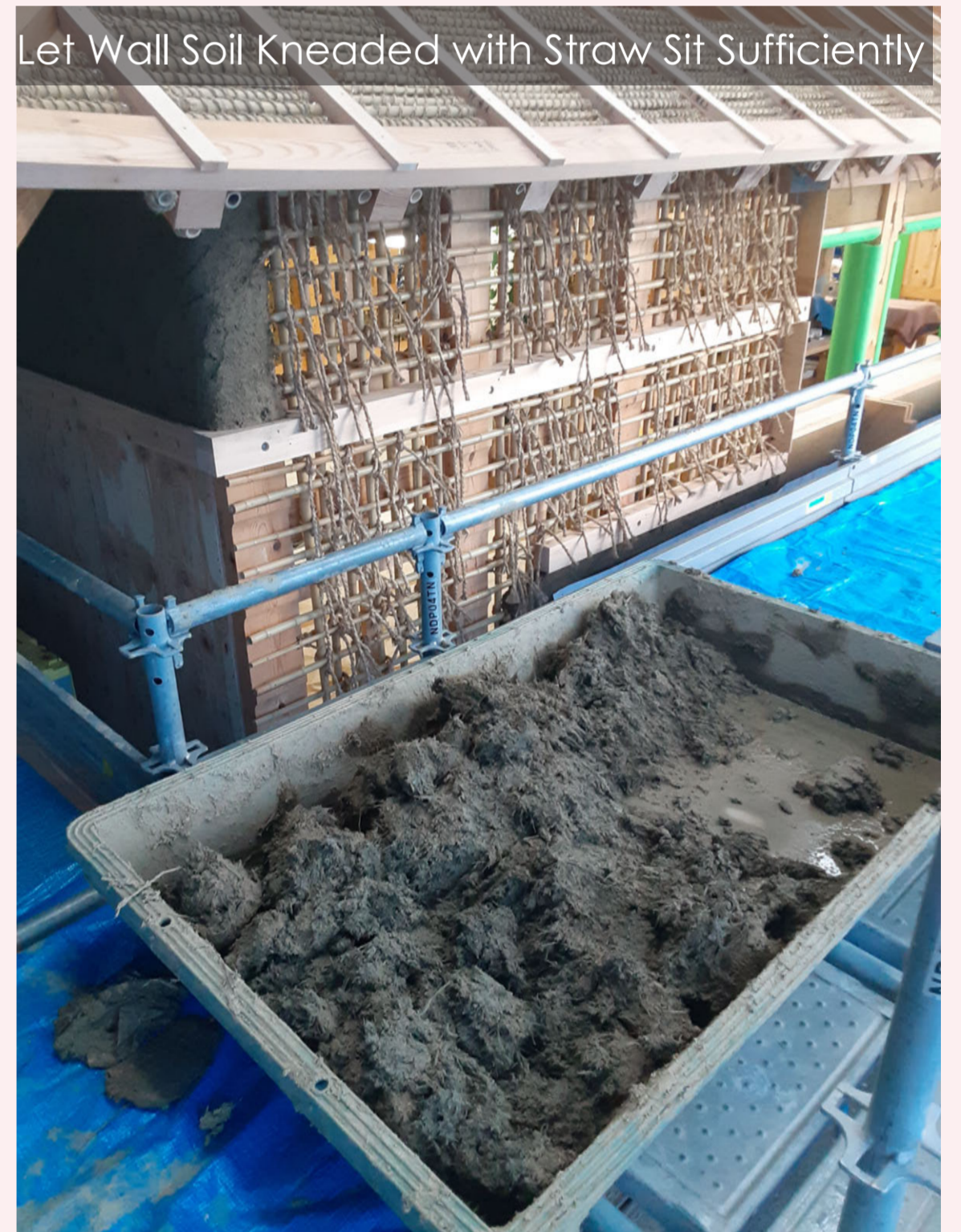
Let Wall Soil Kneaded with Straw Sit Sufficiently