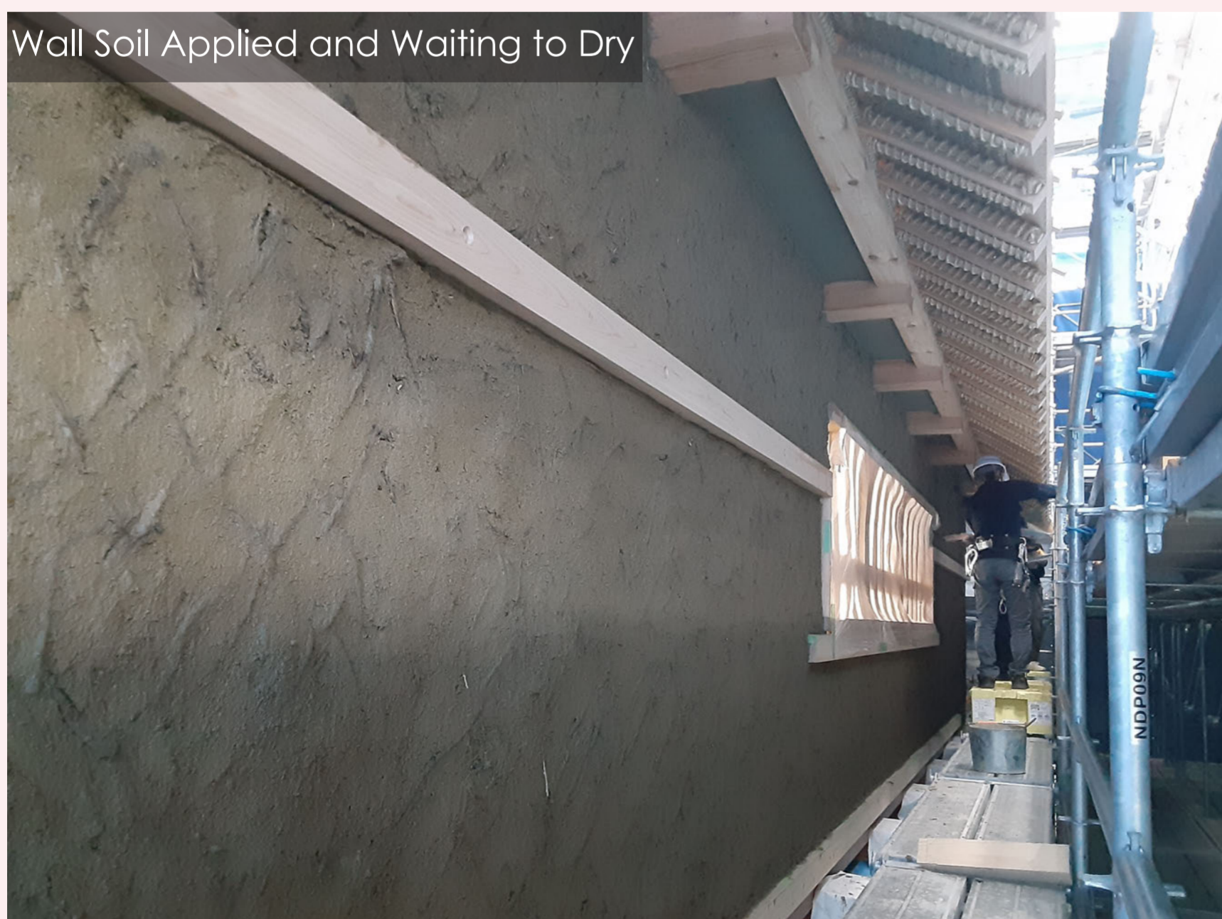
Wall Soil Applied and Waiting to Dry