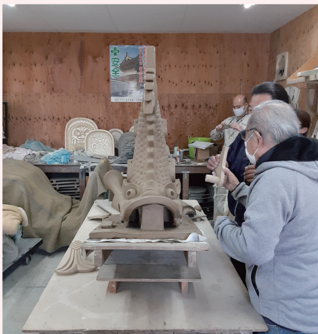
Shaping by Tile Master