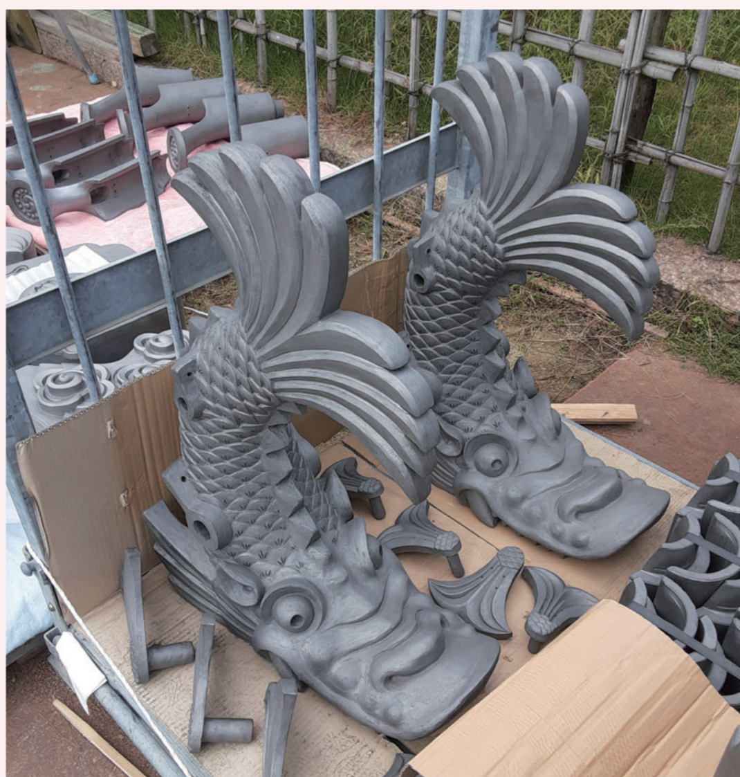
Shachi-gawara after Baking