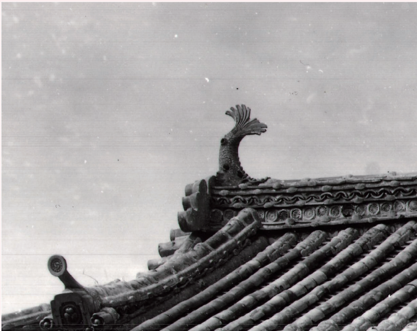
Shachi-gawara in Old Photo (Enlarged)