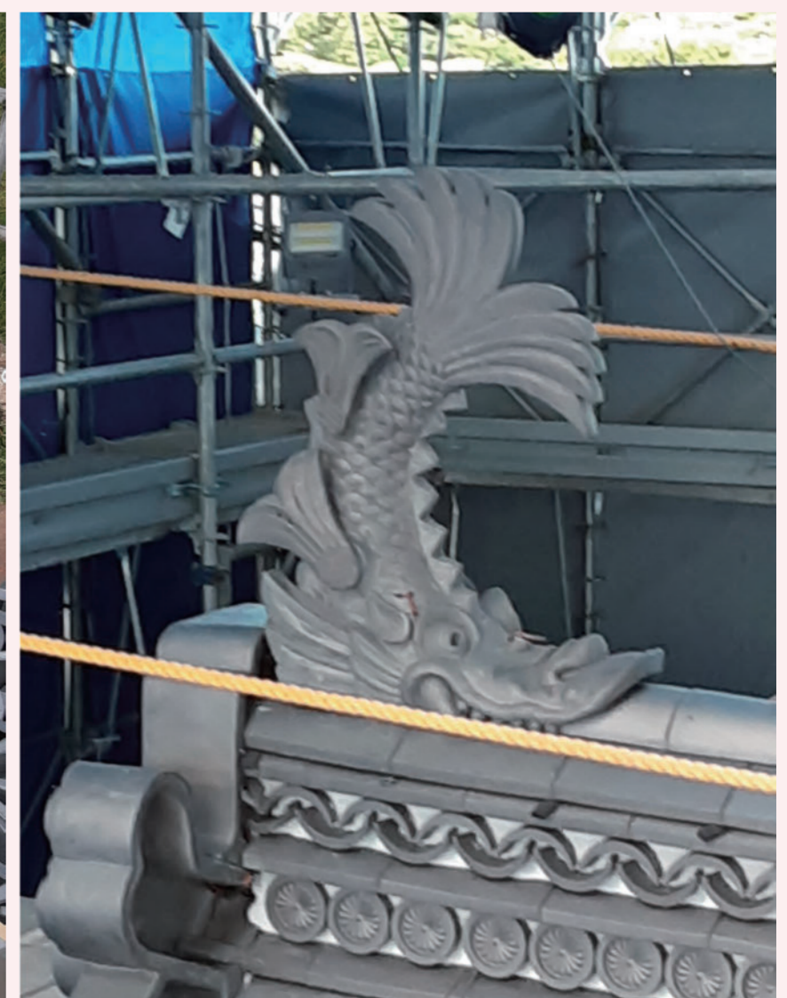
Shachi-gawara on the Roof