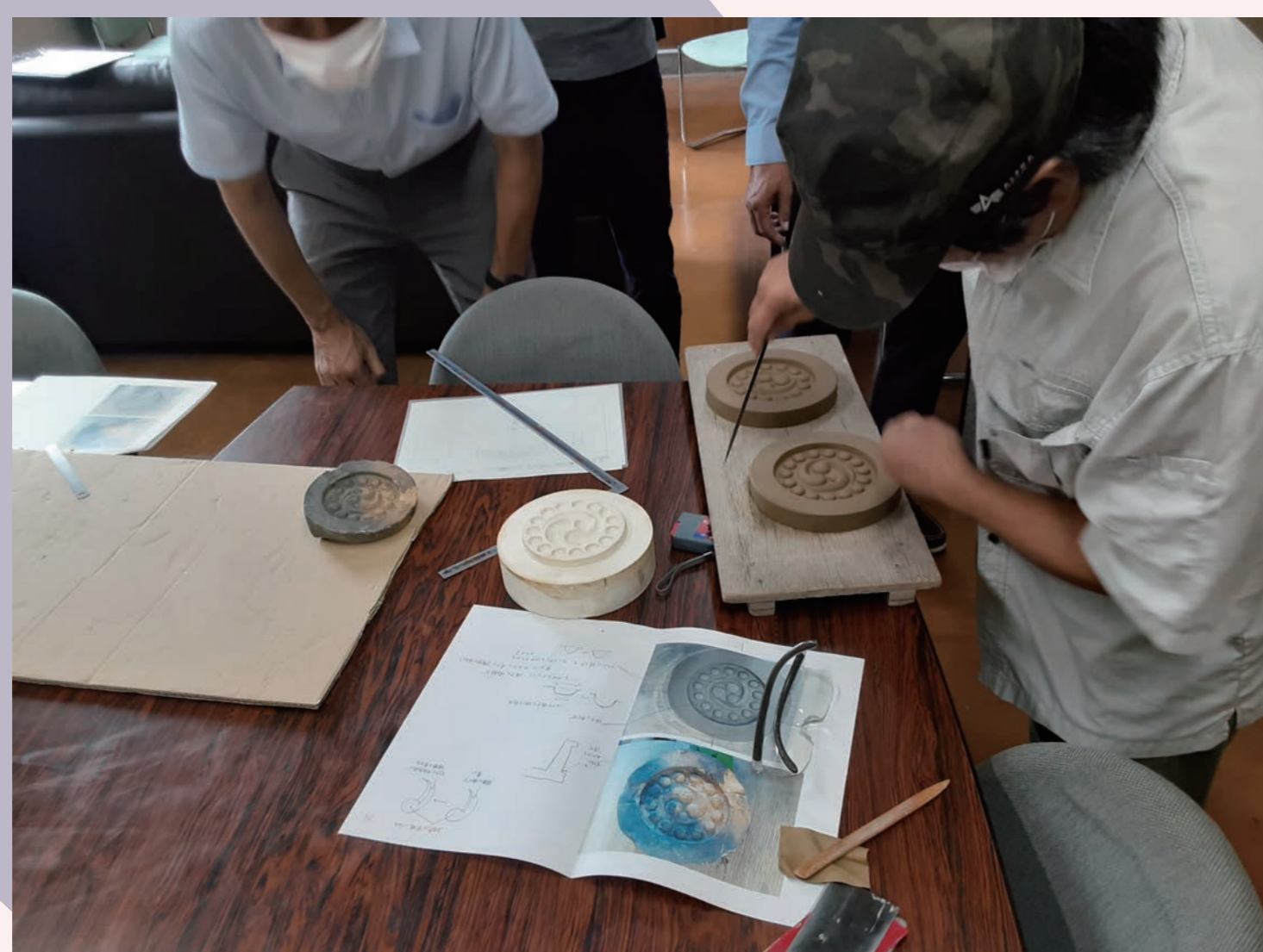
Making Roof Tiles

Many craftsmen, including carpenters, tilers, plasterers, and stonemasons, were involved in the construction exercising their knowledge and skills. While using modern tools, such as heavy machinery and power tools, careful handiwork was done with a strong awareness of Edo Period (1603-1867) and the texture (landscape) of the structure. Look for the modern craftsmanship, which can be seen here and there. It has made it possible to restore this historic gate.