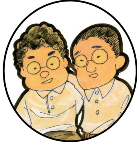
The 4th Shinshicho members, Kikuchi Kan (left) and Kume Masao (right)